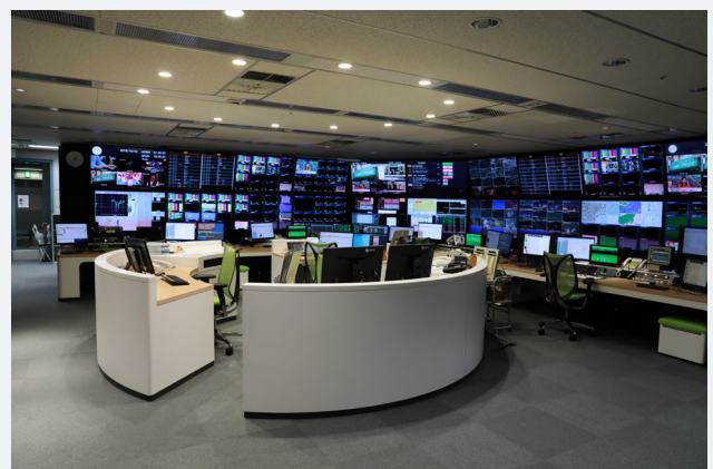
TBS distribution center with videowall

to be distributed throughout the Network Control Center with no perceivable degradation or delay in image quality or limitation in access of equipment to users, whilst maintaining total security and system resilience.