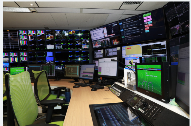
Production working space

The new KVM system would positively aid operators' efficiency by providing them with stable transmission and seamless switching of high resolution video from multiple broadcast devices and control servers. The signals have