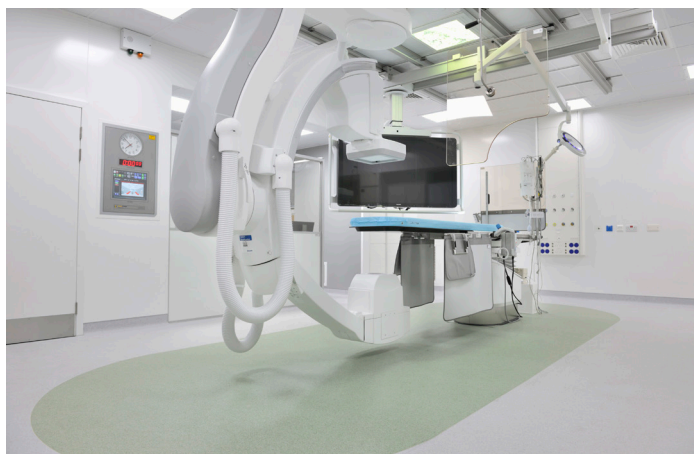
Cardiac Catheterisation Laboratories at St George's Hospital, London, UK

A major improvement programme was scheduled over two years to fully refurbish five cardiac catheter laboratories by Hunters Architects to provide the hospital with the latest, state of the art diagnostic and interventional cardiology equipment.