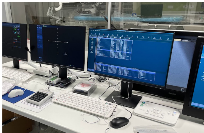
Control desks combining physiologists' and radiographer's workstations