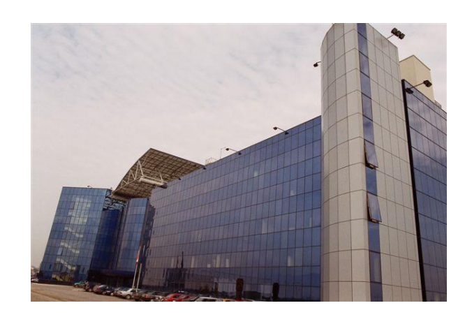
BULATSA main building