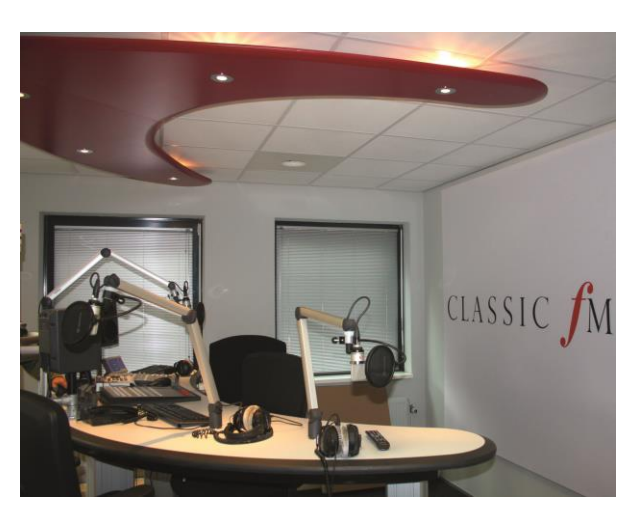
Classic FM studio

"With IHSE you have nothing more to wish for" Berjan Cornelisse Sky Radio Group