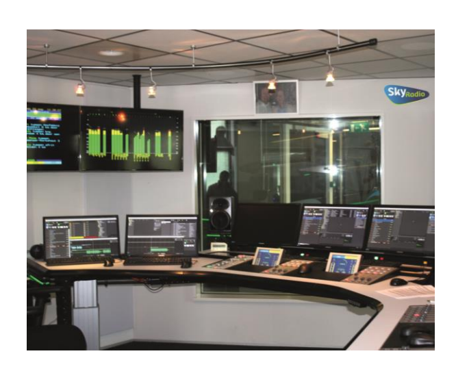
Sky Radio studio