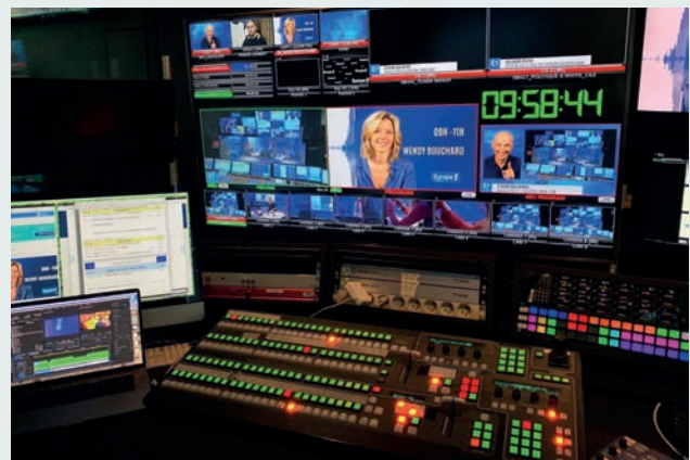
Lagardère studio with multi-screen application served by Draco vario extenders

“ The system provides simplicity of installation, rapid implementation and flexibility in use. It is possible to operate equipment using touch screens, to have large distances between the servers and the screens thanks to the optical fibre links. Operators use computers as though they were in close proximity, under their desks; whereas in actual fact they are many tens of metres away and housed in a highly secure and air-conditioned central equipment room where they can be managed and looked after properly and securely.