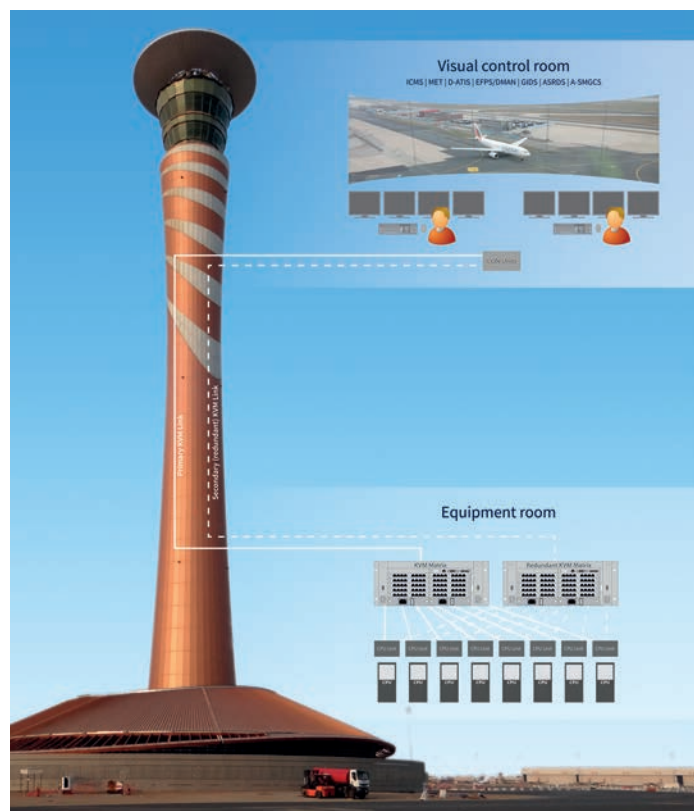
Fully redundant KVM matrix system inside the ATC tower

The new terminal covers an area of 670,000 square meters, has 46 passenger air bridges and is expected to accommodate more than 80 million passengers annually by 2035.