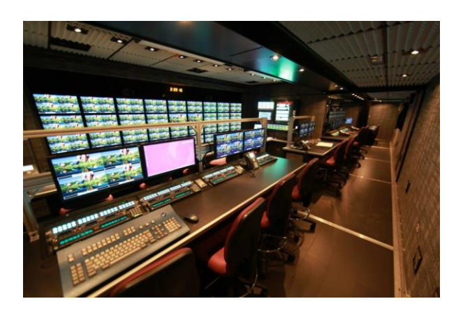
The Spirit Truck: Interior View

Each matrix switch includes redundant power and is connected via a standard network interface for administration setup and diagnostics.