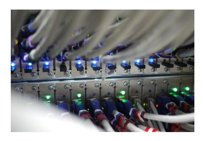
Draco tera enterprise KVM switch in operation