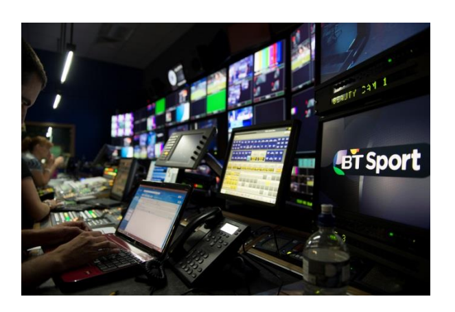
BT Sport studios