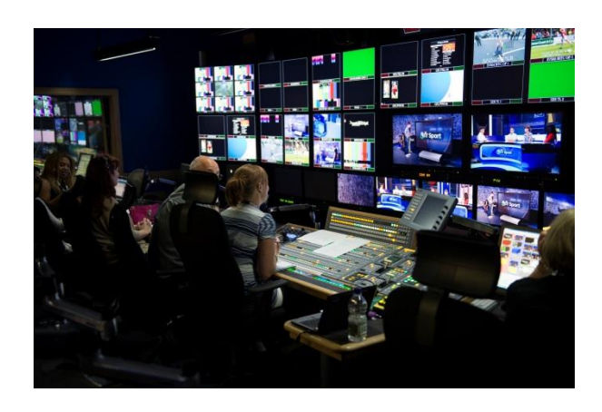
BT Sport studios

and then disconnect the extender cards. When reinstalled later in its final location, the switch automatically identifies the equipment and reconnects. Simple connection between the two Draco tera chassis to form one large, virtual matrix also provided additional functionality to the system.