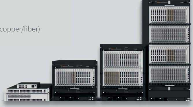
The Draco tera matrix system. Available in a range of sizes from 8 to 576 ports.